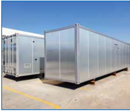
SmartMBBR Package Plant