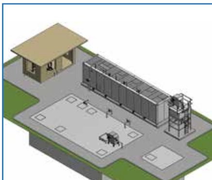
Complete Plant (SmartMBBR)