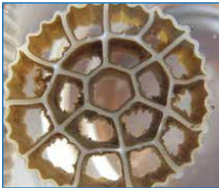
Plastic Media as Bacteria Carrier